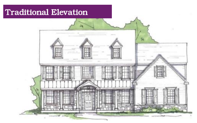
Shown with the following options: transom and sidelights at front door, reverse gable full front porch with 8x8 porch posts, standing seam metal roof, and extended stone, roof dormers, sitting room window, window trim and stone water table at garage.

Shown with the following options: extended stone front, roof dormers, sidelights at front door, 8x8 porch posts, standing seam metal porch roof, sitting room window, and stone water table at garage.