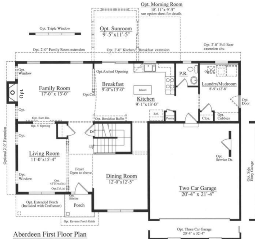
Aberdeen First Floor Plan Traditional and Craftsman Elevations