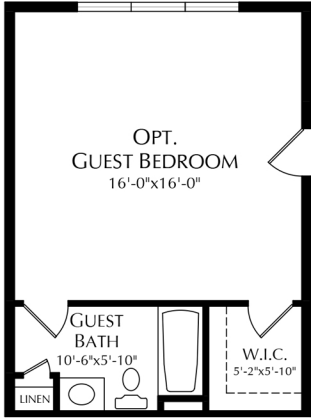
OPT. GUEST BEDROOM ADDS FULL BATH I/O HALF BATH